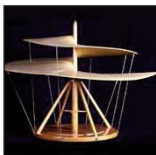
The airscrew: Leonardo anticipates by centuries the application of the propulsion power of the helix. The screw is five metres in diameter, made of reed, linen, cloth, and wire.

The museum will be the location for the Speakers' Reception on Monday, 20 May 2013